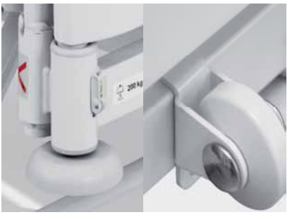
Protective corner bumpers and additional vertical bumpers