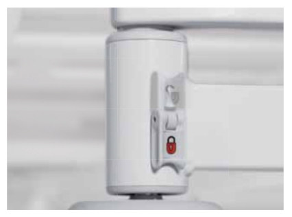
Locking bed ends