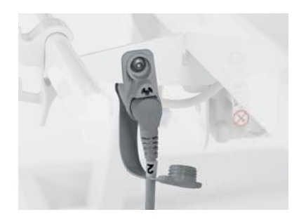
Plug & play [06]