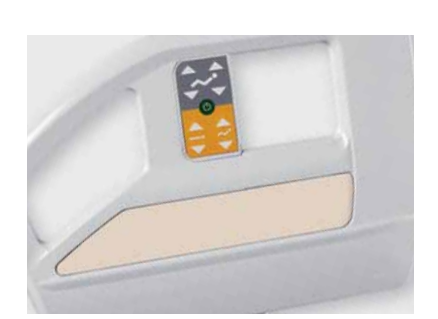
Side rail control [03]

In some cases, particularly when the patient is confused, it may be appropriate to remove the remote control unit. With the Plug and Play socket located on the accessory bar, the handset unit can be easily removed.