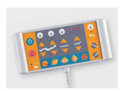
Supervisor panel [04]