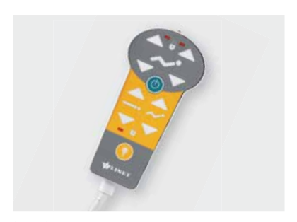
Hand set [05]